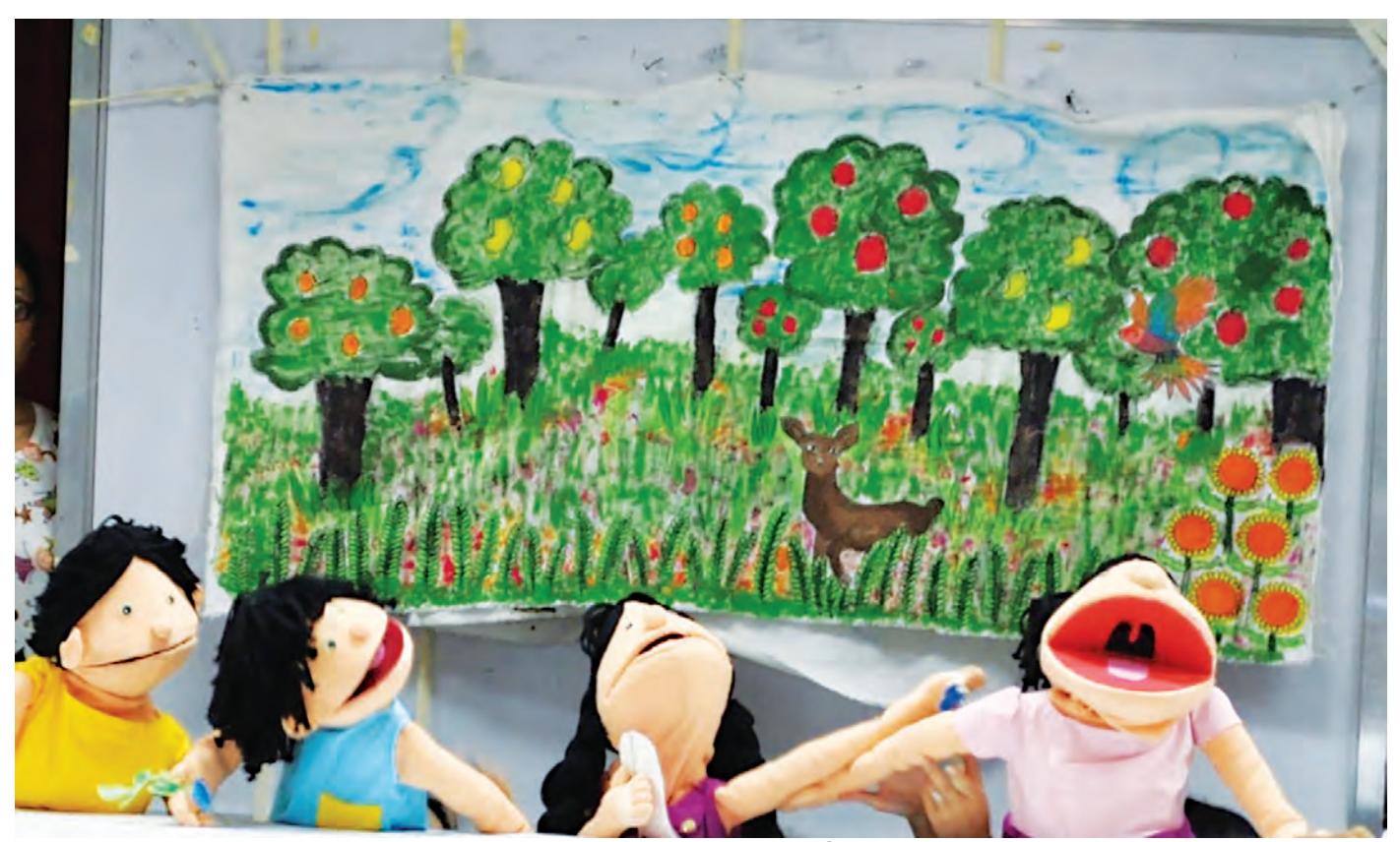
Puppet show on care for the environment