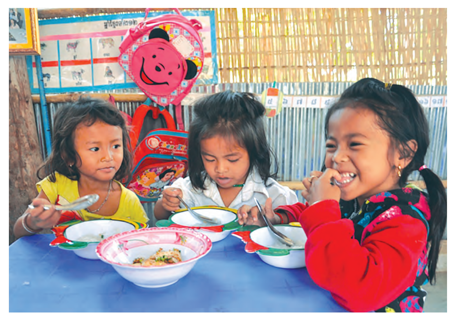
The Breakfast Programme in an iLEAD Community Preschool located in rural Kandal Province.

AEAC recognised the financial challenge in supporting local actors to deliver holistic ECD services early on in the project's inception. In order to develop a project income stream to complement donor funding, two sustainability schemes: rural community microfinance and rice banks were piloted to finance preschool teacher salaries and school construction. However these initiatives had too many borrowers defaulting on their loans and an alternative financing solution had to be found to continue operations.