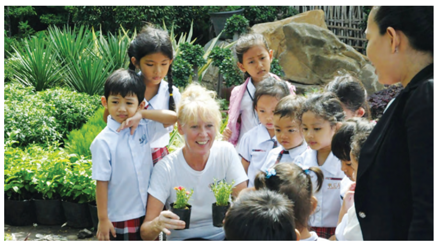
iLEAD International School students learning about plants and the environment

The centre provides training and resources and is also the quality assurance arm of the iLEAD Community Centre preschool service delivery. Faculty from iLEAD International School deliver training to the teachers of the iLEAD Community Centre preschools in modern, child-friendly pedagogical methodology.