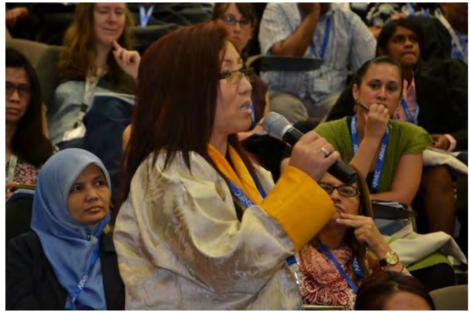
A conference participant from Bhutan posing questions during the plenary session at the opening ceremony