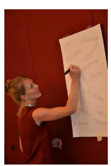
Skilful Parenting Workshop