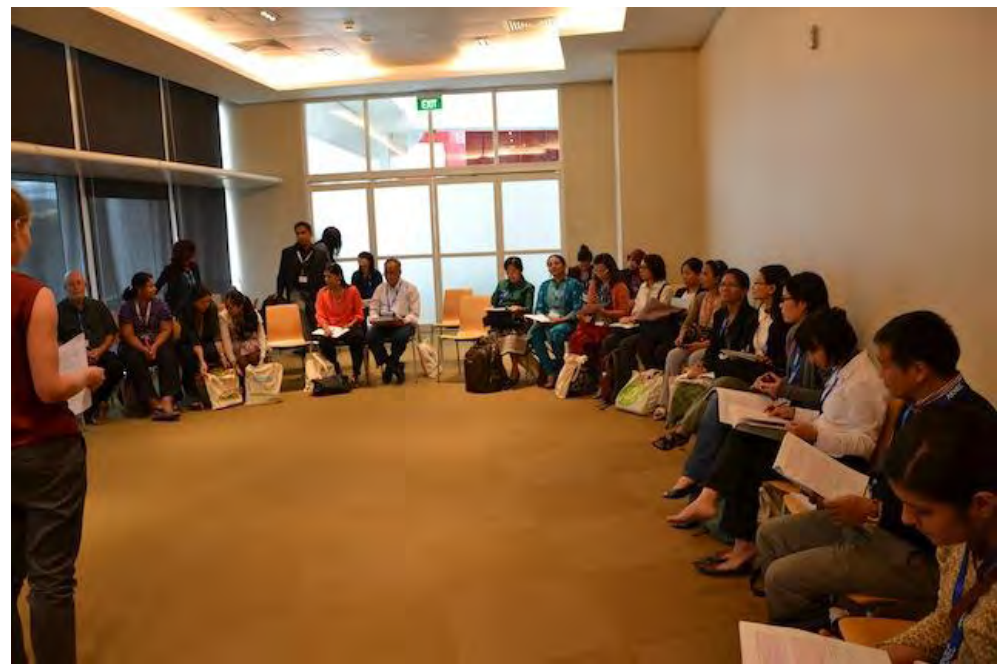
Parenting Workshop facilitated by ICS Asia, Cambodia