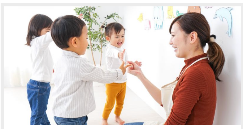
Asia-Pacific Early Childhood Care and Education: Teacher Training Handbook for Social and Emotional Learning (APETT-SEL)

Prepared by ARNEC and UNESCO Bangkok, the APETT-SEL and its modules have been released to the public.