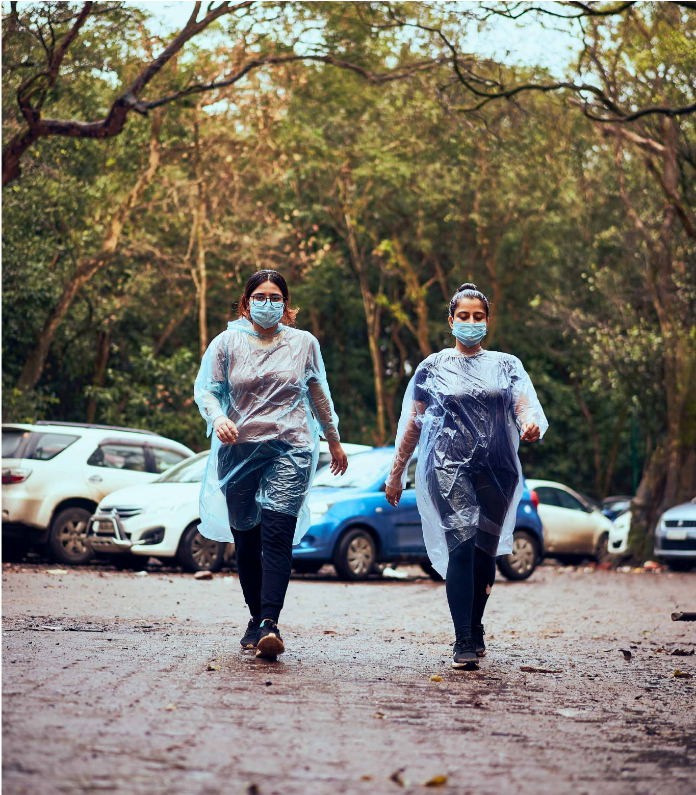
Photograph: Ashwini Chaudhary/Unsplash, India