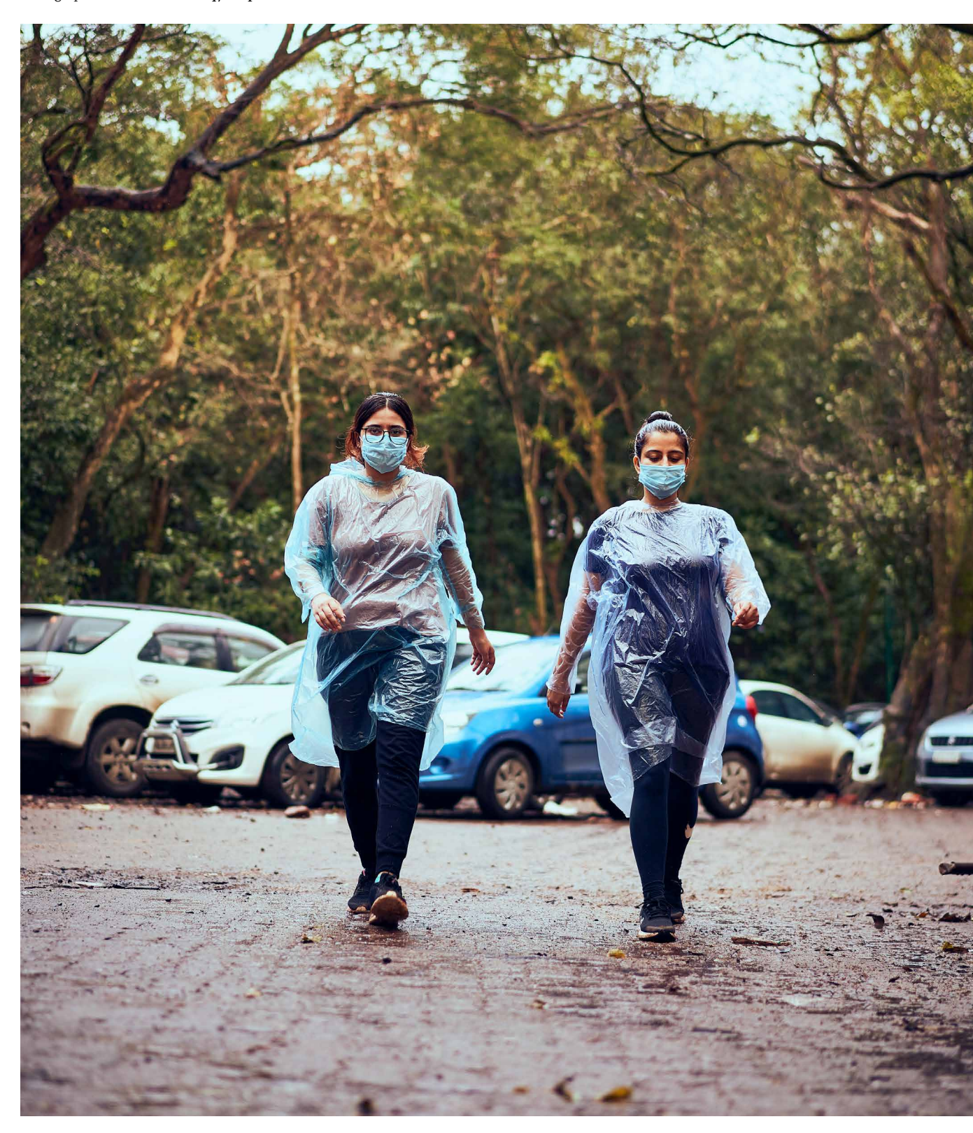
Photograph: Ashwini Chaudhary/Unsplash, India